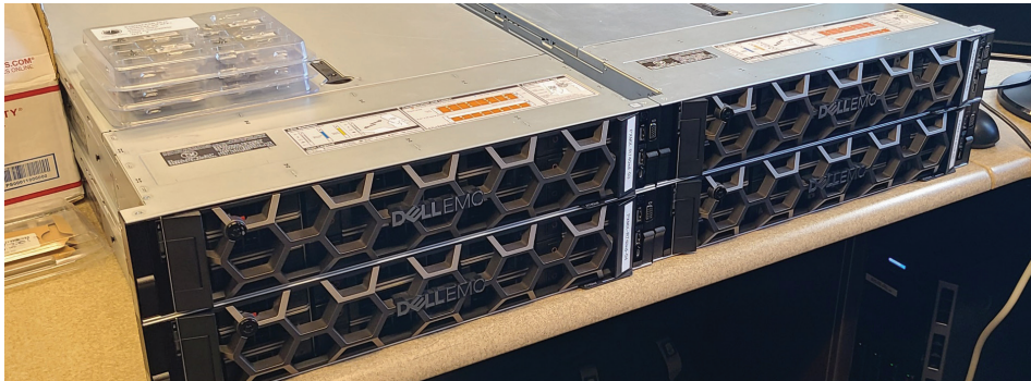
Our internal servers perform a variety of critical tasks for us here at Runestone Telecom.

Runestone Telecom's amazing IT technicians are constantly working behind the scenes to make sure our internal support system performs at its best, which enables us to better serve you. We are happy to have such gifted individuals as part of the Runestone Telecom team.