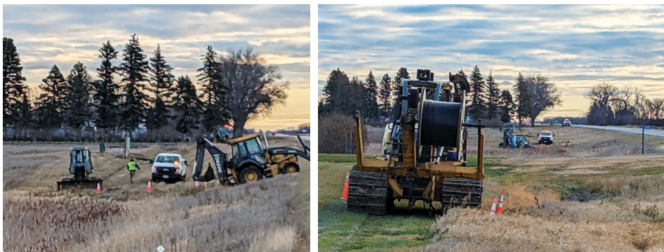
These field photos are of work in progress near Wheaton in the Traverse County Phase 1 area of our fiber build.